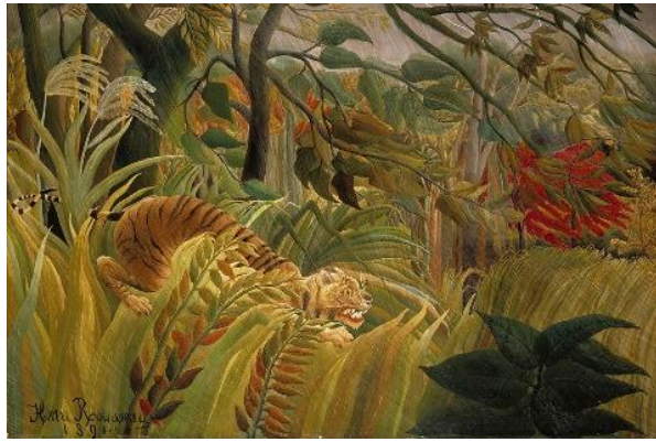
'Surprised' Henri Rousseau oil on canvas 1891