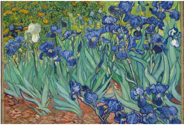
'Iris' Vincent Van Gogh oil on canvas 1889