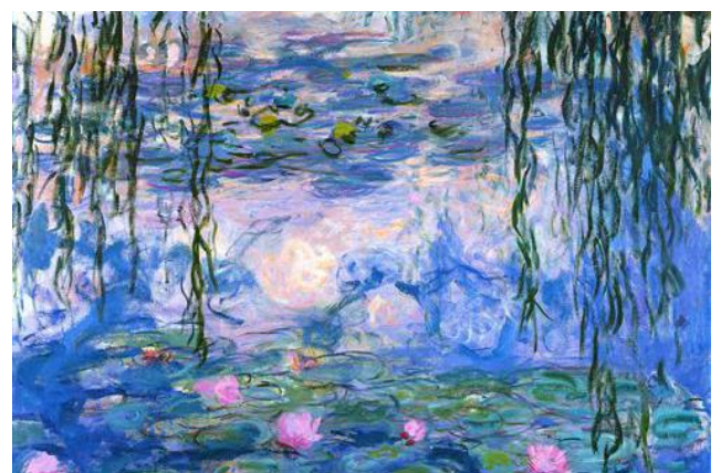
Water Lilies Claude Monet oil on canvas 1917-19