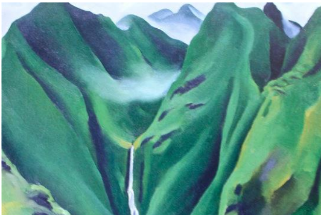
Waterfall, No 1 Iao Valley Maui Georgia O'Keefe oil on canvas 1939